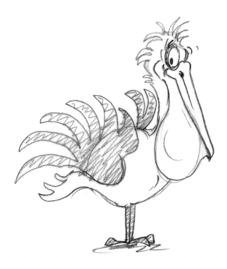
9. Ta da! Now add some colour.

Escape to Everywhere! Where will Percy escape to? Where will his next adventure take him? That story is totally up to you.